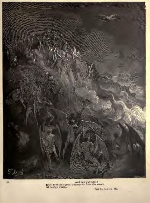
43 And now ascending Rise from this great Abyss from the search Of every Wretch. Act II, line 449: 451