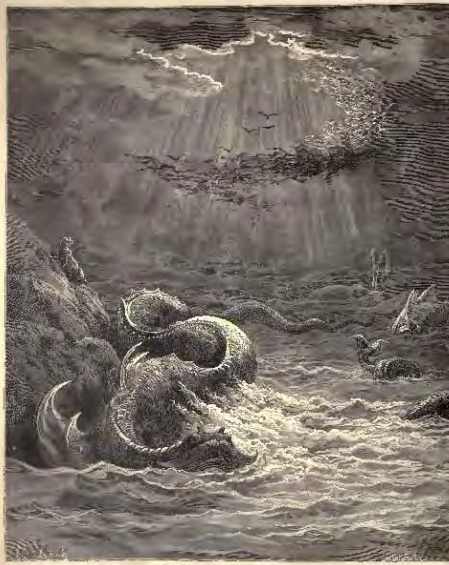
And God said, "Let the waters generate Reptile with spawn abundant, living Soule: And let Fowle flie above the Earth, with wings Display on the op'n Firmament of Heav'n." JOB VII. VER. 28-31.