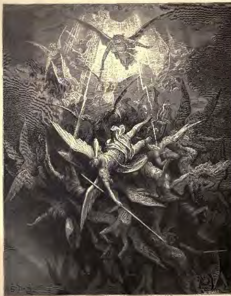
When the Almighty Force Hurl'd headlong flaming from the ethereal sky, June 2, 1840, 44, 45.