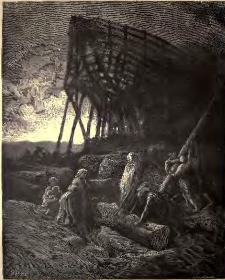
41 Begin to build a vessel of huge bulk, Gen. 6:15, Rev. 7:1.