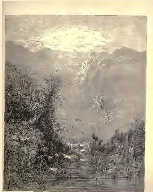
35 Nestes fill the fertile caves and fens, and shores, Their brood as numerous hatch. Book XII. Verse 68. 1711.

And seems a moving Land, and at his Gills Draws in, and at his Trunck spouts out a Sea.