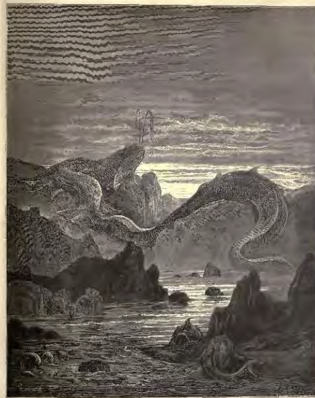
32 And seems a moving Land, and at his Gills Draws in, and at his Trunck spouts out a Sea. Book XII. Verse 65. 1711.