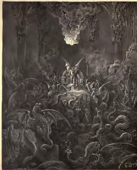
44 Beautiful was the Air Of Lulling through the Hill, thick-dreaming so With complete motions, and the full, And so, the full—G.H.