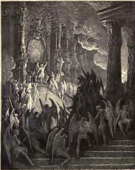
High on a throne of a royal state, which far Outshon the wealth of Ormus and of Ind, And J. J. J. J. J.