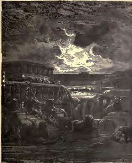
48 Please overwhelmed, and them, with all their goods, Keep under your mill. All ev'nings else 2nd 27, Six 145-748